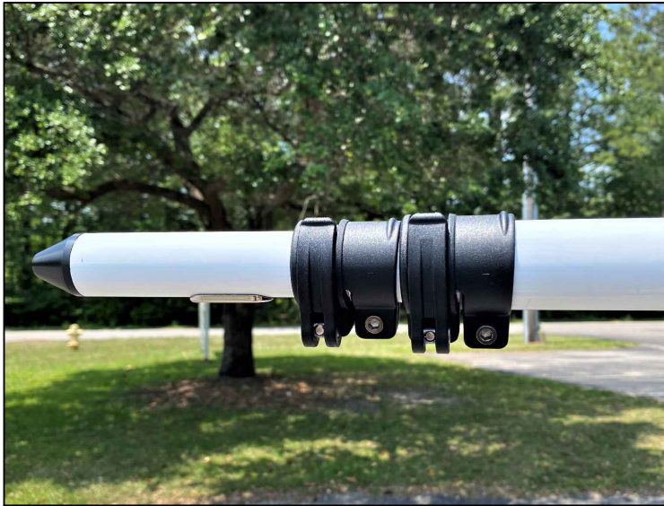
PHOTO 3 - IF INSTALLED CORRECTLY, YOUR OUTRIGGERS SHOULD LOOK LIKE THIS, CLAMP LEVERS SHOULD OPEN DOWNWARD AND OUTBOARD

YOUR OUTRIGGERS ARE SHIPPED WITH A COLOR CODED ADAPTER SLEEVE WHICH CORRESPONDS TO THE SPECIFIC MOUNTS ON YOUR BOAT. YOUR OUTRIGGERS ALSO COME PRE-DRILLED FOR THE PIN WHICH HOLDS THE OUTRIGGER IN ITS MOUNT. TO INSTALL YOUR OUTRIGGERS, SLIDE THE OUTRIGGERS IN UNTIL THEY BOTTOM OUT ON THE LIP OF THE ADAPTER SLEEVE AS SHOWN IN PHOTO 4. WITH YOUR OUTRIGGER POINTED STRAIGHT BACK IN THE STOWED POSITION, THE CLAMP LEVERS SHOULD POINT OUTWARD AND THE HALYARD GUIDES SHOULD POINT DOWN TOWARDS THE WATER AS SHOWN IN THE DIAGRAM BELOW AND IN PHOTO 3. IF YOUR HALYARD ENTRY POINTS DOWN AND YOUR CLAMPS DO NOT POINT OUTWARD, SIMPLY SWITCH THE OUTRIGGER TO THE OTHER SIDE OF THE BOAT.