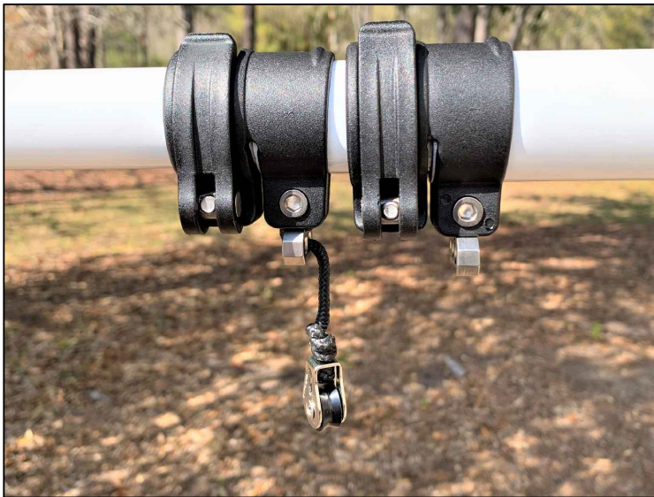
PHOTO 3 - IF INSTALLED CORRECTLY, YOUR OUTRIGGERS SHOULD LOOK LIKE THIS, CLAMP LEVERS SHOULD OPEN DOWNWARD AND OUTBOARD

YOUR OUTRIGGERS ARE SHIPPED WITH A COLOR CODED ADAPTER SLEEVE WHICH CORRESPONDS TO THE SPECIFIC MOUNTS ON YOUR BOAT. YOUR OUTRIGGERS ALSO COME PRE-DRILLED FOR THE PIN WHICH HOLDS THE OUTRIGGER IN ITS MOUNT. TO INSTALL YOUR OUTRIGGERS, SLIDE THE OUTRIGGERS IN UNTIL THEY BOTTOM OUT ON THE LIP OF THE ADAPTER SLEEVE AS SHOWN IN PHOTO 4. WITH YOUR OUTRIGGER POINTED STRAIGHT BACK IN THE STOWED POSITION, THE CLAMP LEVERS SHOULD POINT OUTWARD AND THE HALYARD GUIDES SHOULD POINT DOWN TOWARDS THE WATER AS SHOWN IN THE DIAGRAM BELOW AND IN PHOTO 3. IF YOUR HALYARD GUIDES POINT DOWN AND YOUR CLAMPS DO NOT POINT OUTWARD, SIMPLY SWITCH THE OUTRIGGER TO THE OTHER SIDE OF THE BOAT.